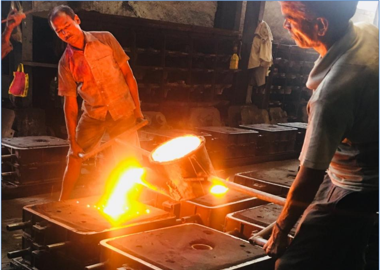
Gang of treatment & pouring ladles for maximum size up to 5 tons per single piece